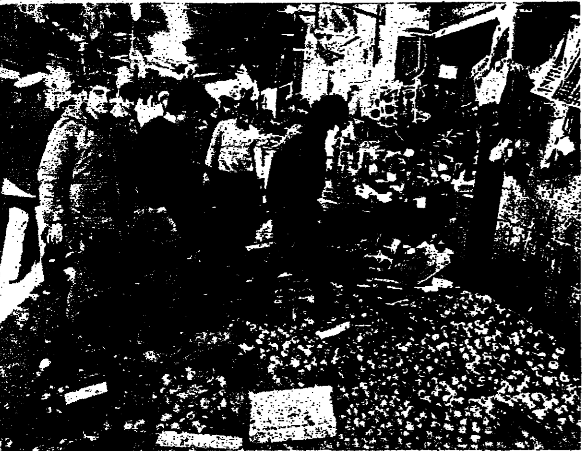
Security men inspect the site of yesterday's bombing in Jerusalem's Mahane Yehuda market. (Rahamim Israeli)

Jerusalem Post Reporter HAIFA. — A small explosive charge went off inside a sidewalk garbage bin outside the main synagogue in the Rehov Herzl main street at 6:15 last night. No one was hurt and practically no damage was caused by the charge, which had been stuffed inside a metal pipe. The road was almost empty at the time. Police diverted the traffic and started investigations but nothing more was discovered. The police arrested 26 residents for questioning.